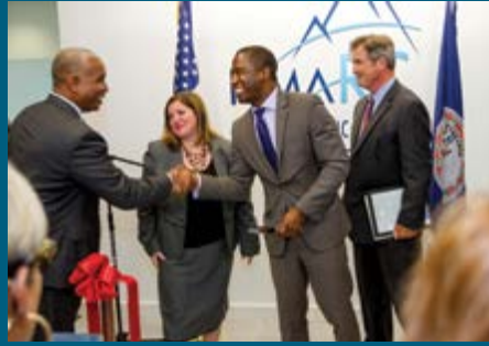
ICMA-RC opened a 200-employee service center in 2017.

Elephant Auto Insurance, a UK company operating in the Richmond Region since 2009, has grown from a 50-employee start-up to a 1,700 employee national player. The company also launched Compare.com, a price comparison site.