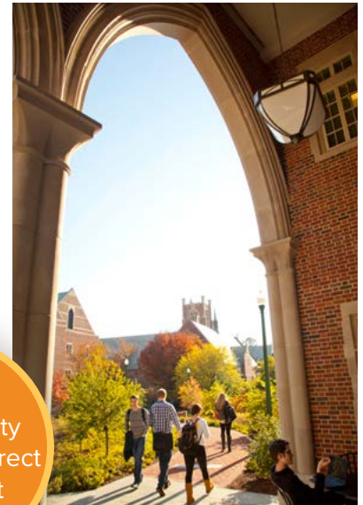
University of Richmond

A Top Mid-Sized American City for Foreign Direct Investment - fDi Intelligence, July 2019