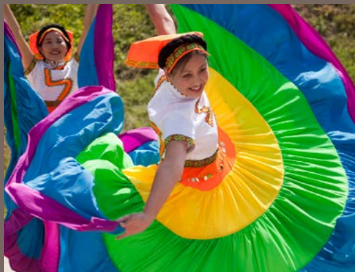
Chinese dancers at the annual Dragonboat Races

the Chinese New Year Festival, ChinaFest!, Richmond International Dragon Boat Festival, Asian-American Festival and the Virginia Asian Chamber Gala